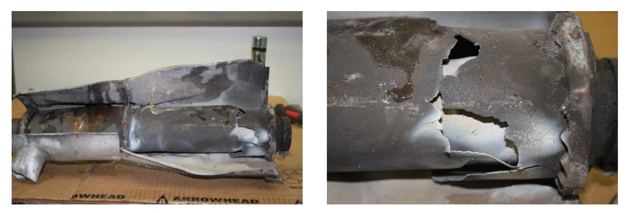
Figure 2. Fractured exhaust muffler from a Hefty Polar Cub airplane (left) and a close-up photograph of the fracture in the exhaust muffler (right).

Witnesses observed an experimental amateur-built, Hefty Polar Cub airplane flying erratically at a low altitude before impacting terrain. A postcrash fire ensued, and the pilot was fatally injured. Toxicology testing revealed that the pilot's CO level was 48%; no soot was found in his airways, indicating the CO was not a result of the fire; thus, the NTSB determined that the pilot's severe CO impairment likely caused the pilot's loss of airplane control. Examination of the airplane's exhaust system revealed that the exhaust/heater muffler was fractured, allowing CO to enter the cockpit (see figure 2). (ANC16FA065)