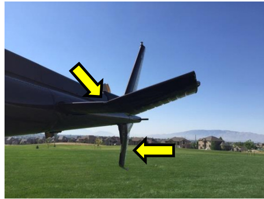
Figure 4. Empennage (horizontal stabilizer and vertical fin).