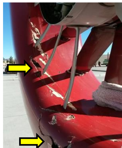
Figure 2. Lower fenestron housing.